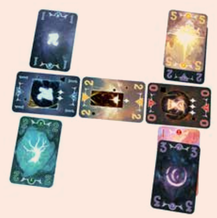
Three conflicts: Artifacts with attached cards

Starting with the first player, each player takes turns placing one energy card from their hand into one of the three conflicts. Each player places their cards on opposite sides of the conflict's Artifact, as in the example image below. Both players continue this way until they pass, either because they no longer wish to play cards, or they have run out.